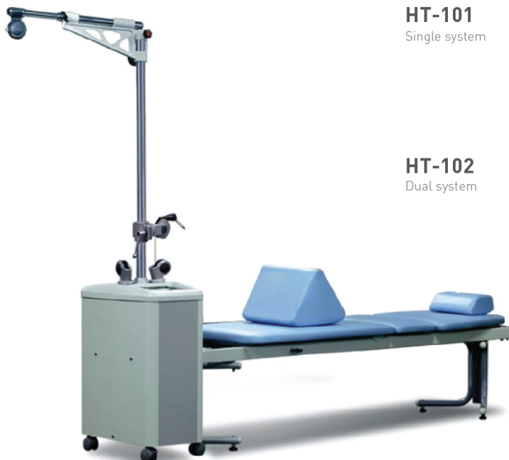
HT-101 Single system

* HT-102S (with one bed), HT-102D (with two beds)