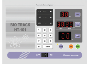
HT-101 Biotrack Single Control Panel