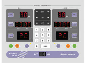
HT-102 Biotrack Dual Control Panel